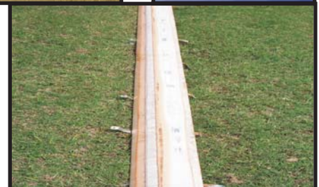
This bar application has run Successfully for over 14 years.